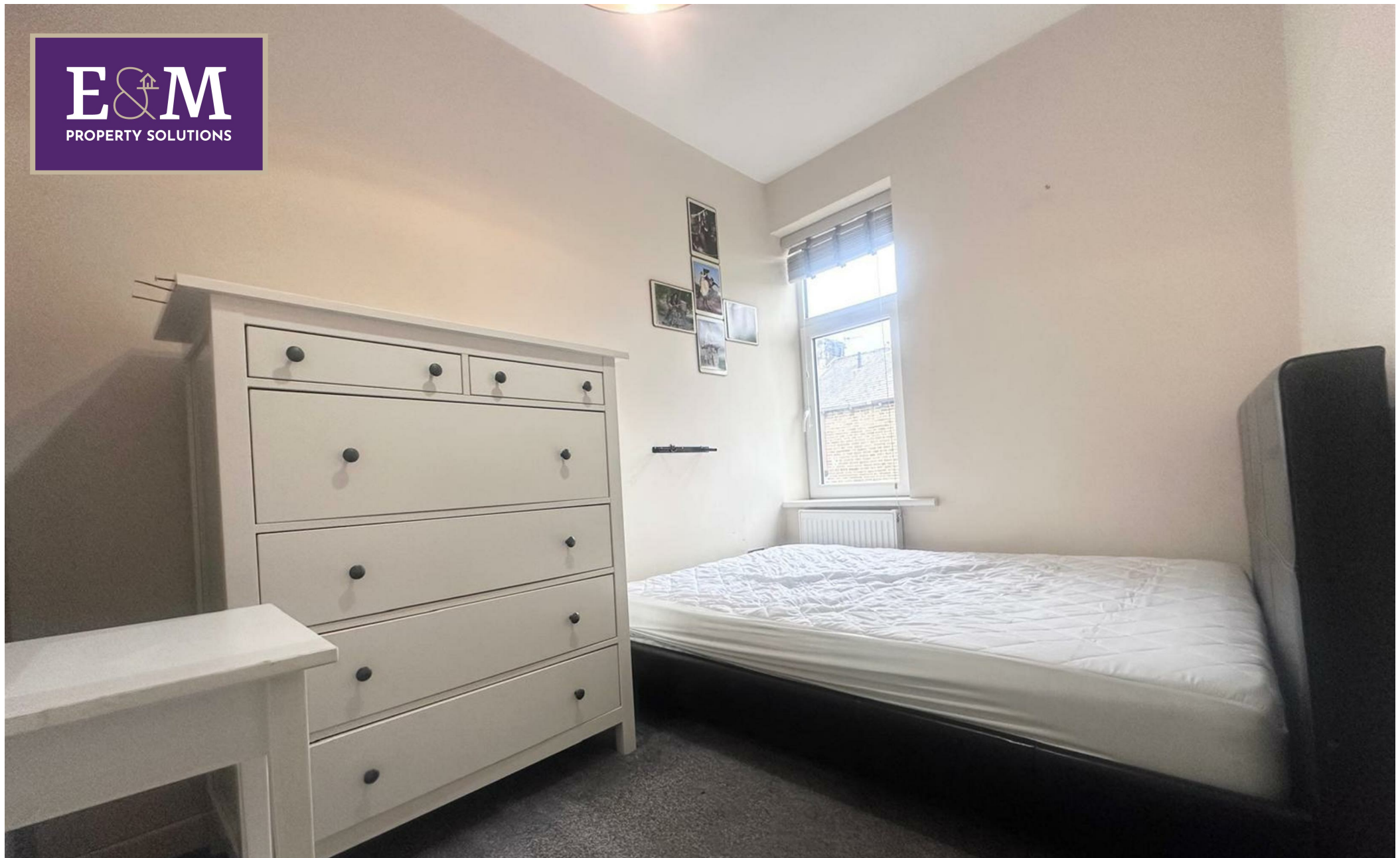
ROOM 2, 8 Hinton Street, Burnley, Lancashire, BB10 4EB £90 Per week